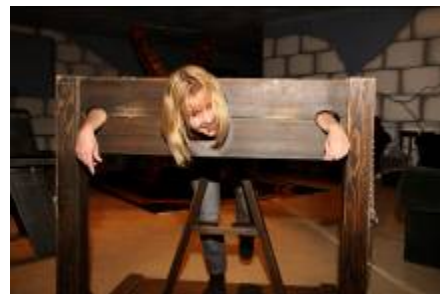
Captured Audience in the Dungeon Room