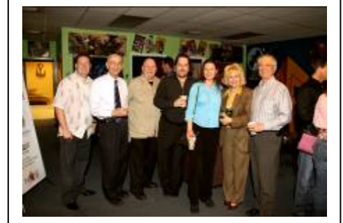
More Sin City Chamber Partygoers