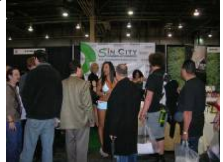
Greeting the crowd at the Sin City Chamber booth