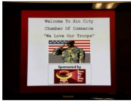
We love our Troops