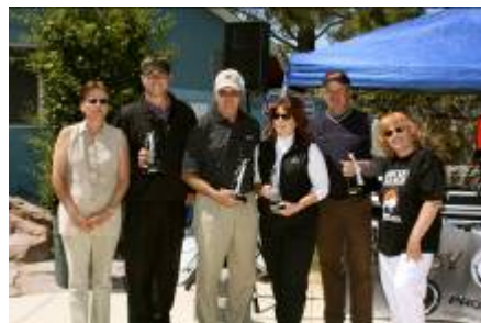
Trophy presentation to the winning golfers